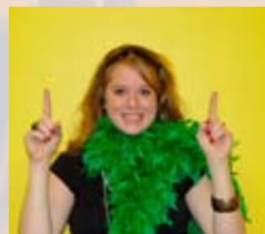
WHAT JESUS SAYS